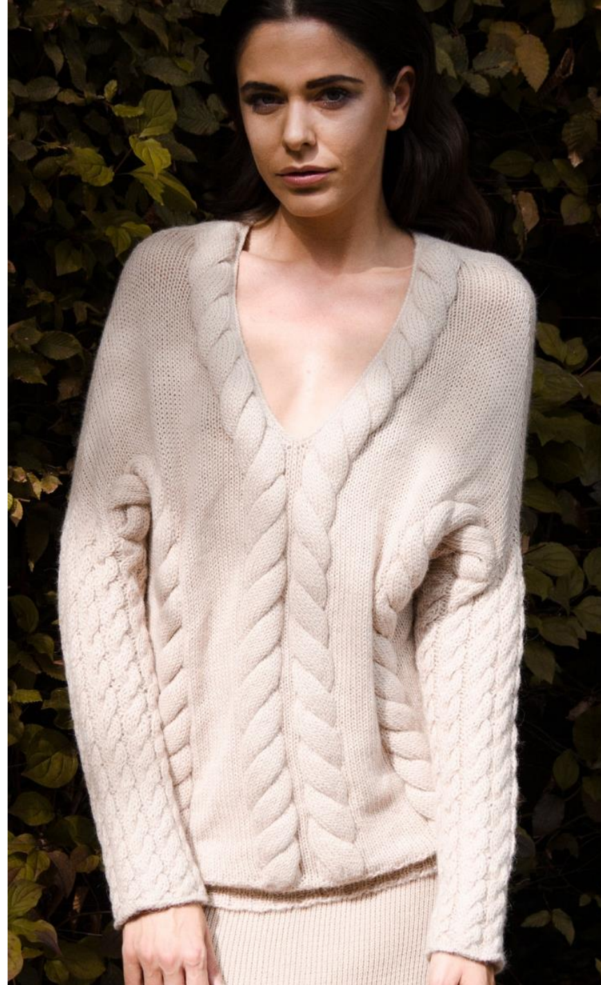
Sweater Alpaca USD$68.00