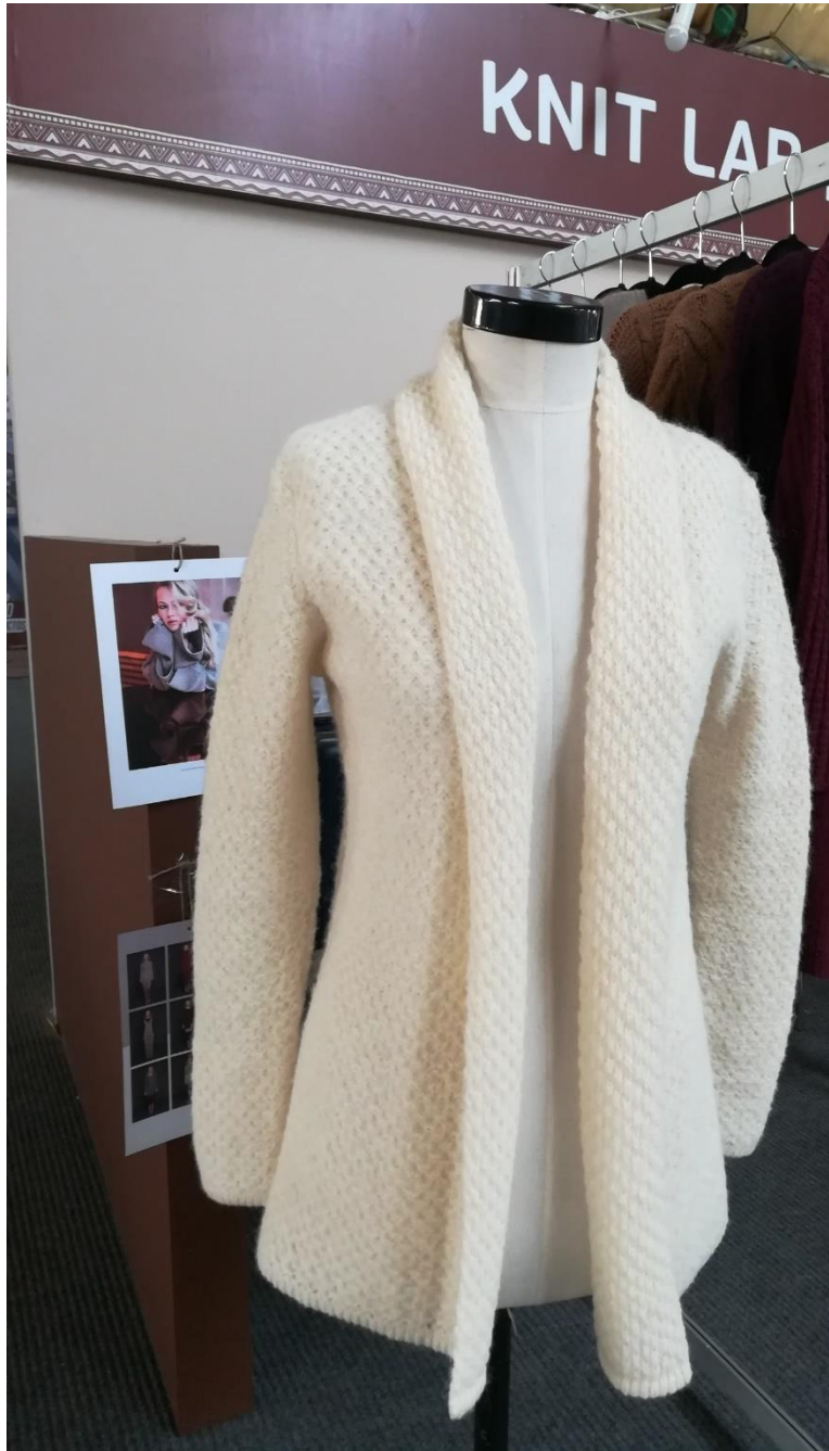
Cardigan Alpaca and Polyamide (Caravelli) USD$46.00