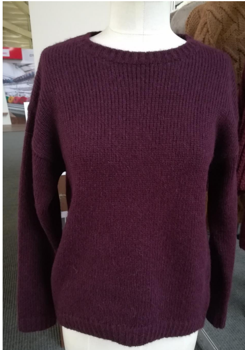
Sweater Baby Alpaca, Merino Wool and Polyamide (Pujpu) USD$53.00