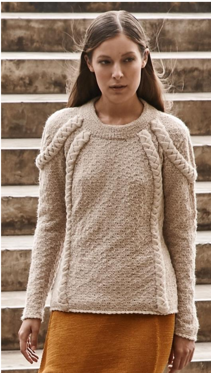
Sweater Alpaca USD$51.00