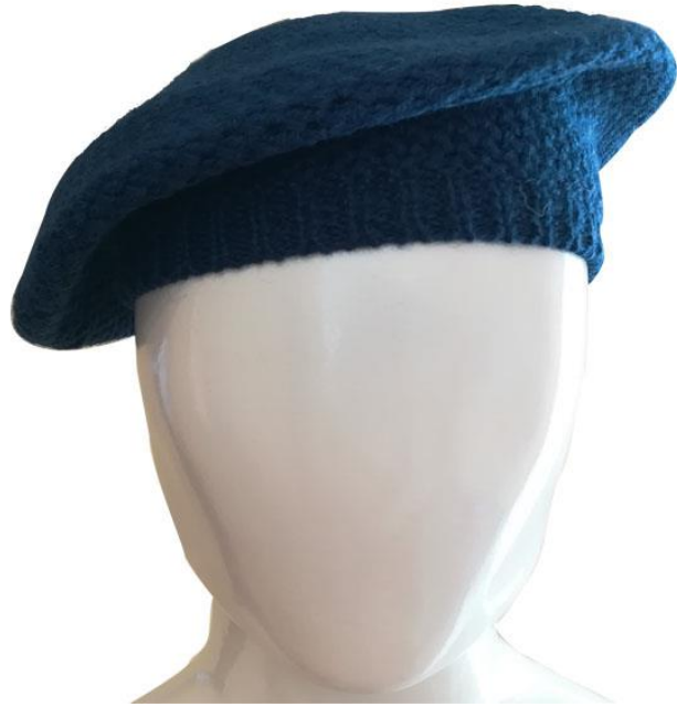
Beret Baby Alpaca USD$26.00