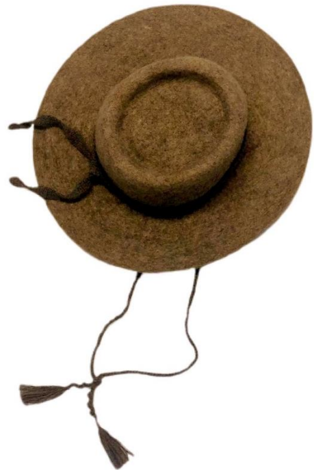
Hats Alpaca USD$50.00