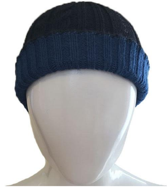
Beanie Reversible Baby Alpaca USD$29.00